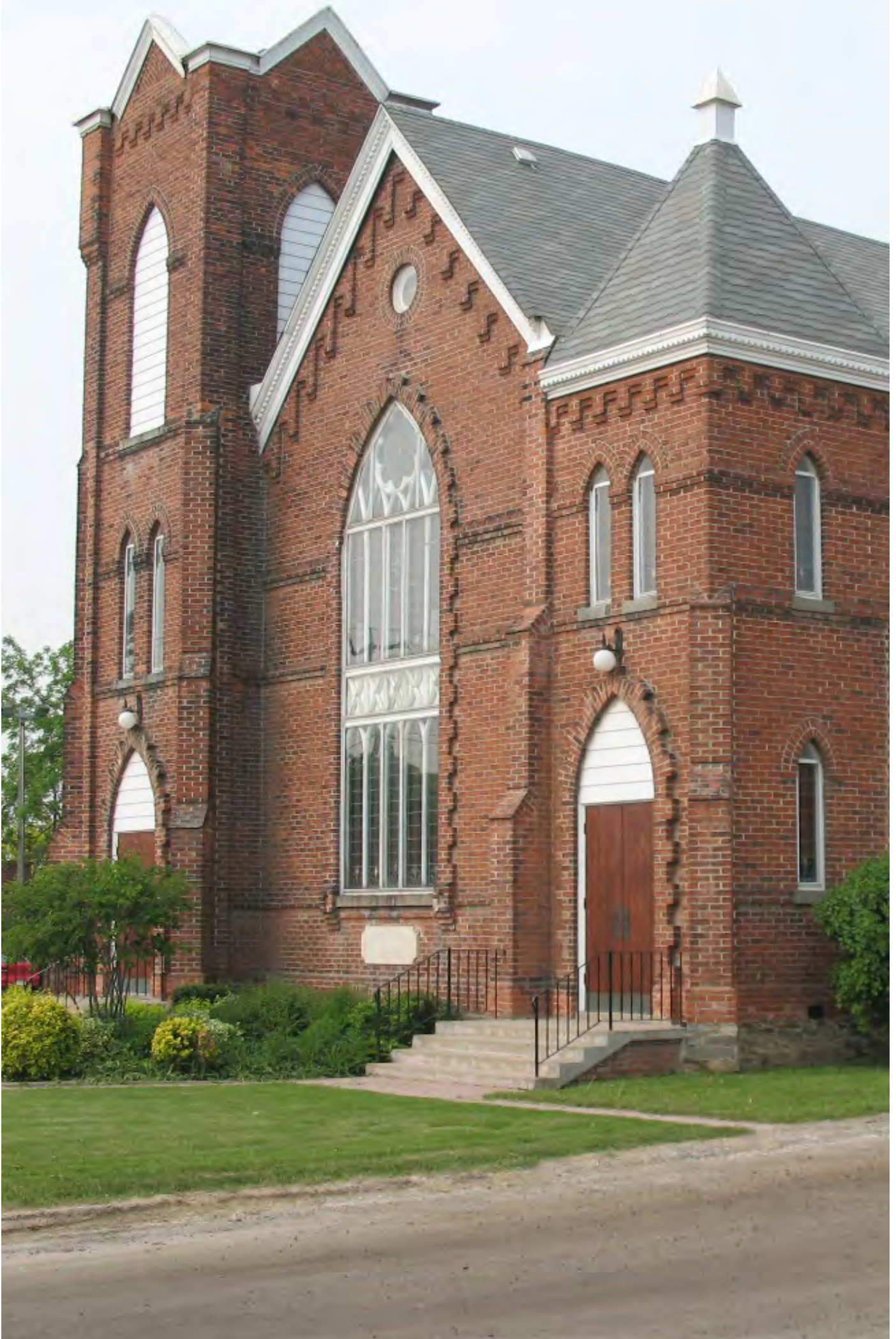
Woodbridge United Church