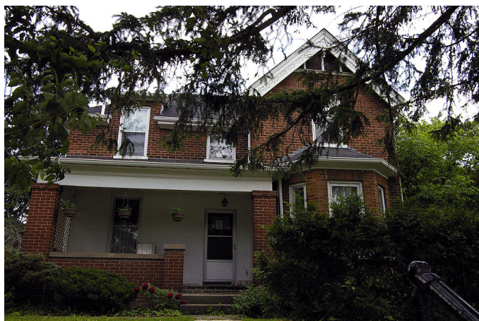
8025 Islington Avenue