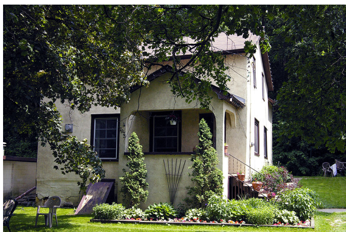
7973 Islington Avenue