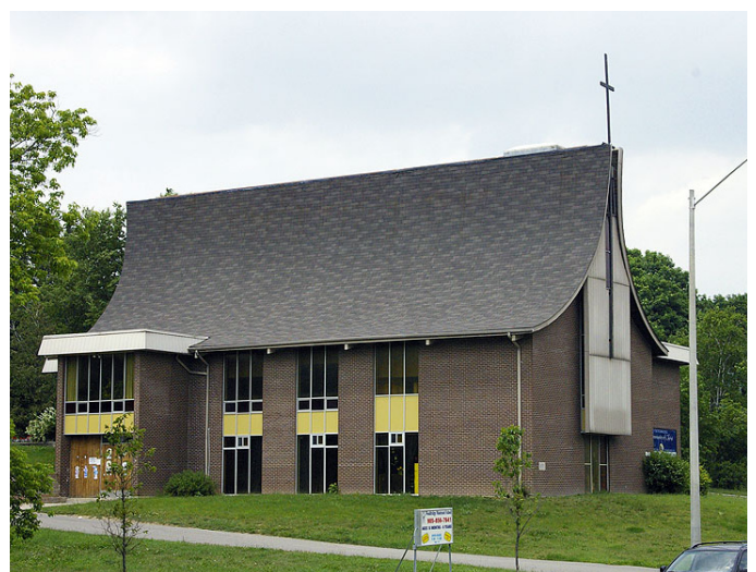
8142 Islington Avenue